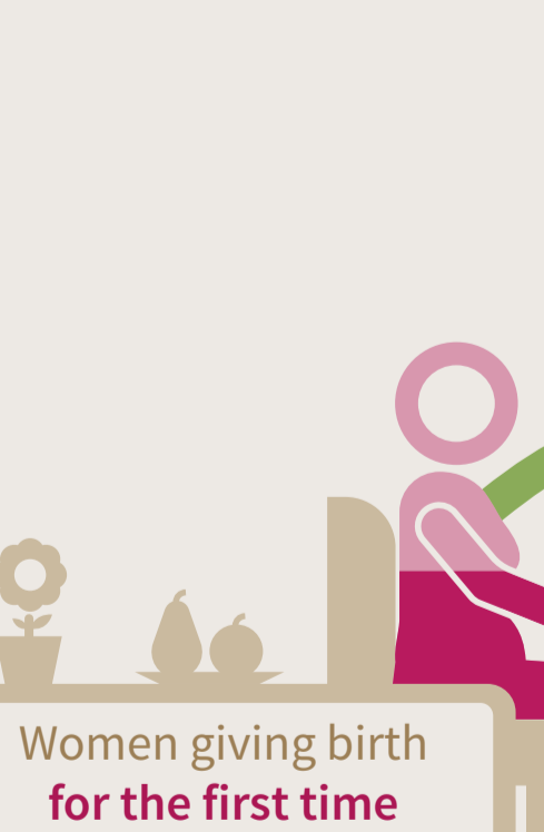
Women giving birth for the first time

Regarding emotional changes which may be experienced after the birth, just 54% of women giving birth for the first time felt they were definitely given enough information ,