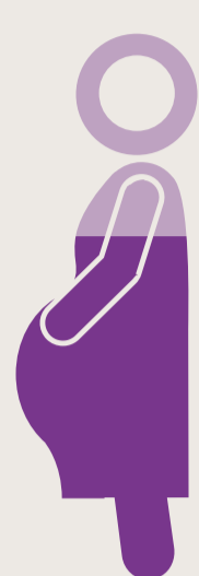
Women who have given birth previously

compared to 63% of women who have given birth previously.