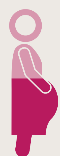
Women giving birth for the first time

53% of women giving birth for the first time were definitely given enough information from a midwife or doctor about where to have their baby ,