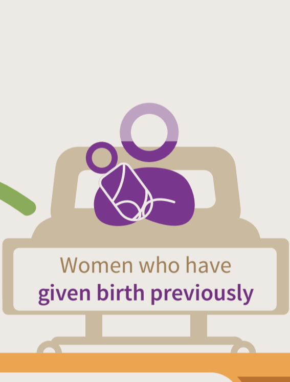
Women who have given birth previously

compared to 69% of women who have given birth previously.