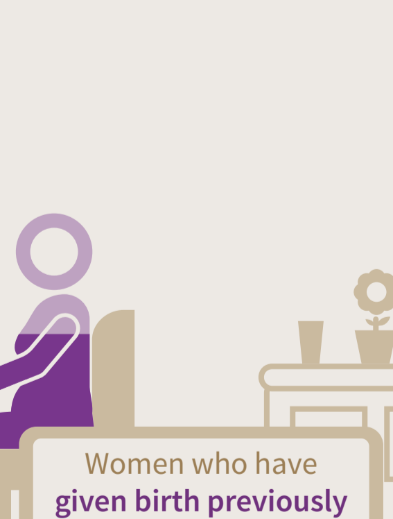
Women who have given birth previously

compared to 61% of women who have given birth previously.