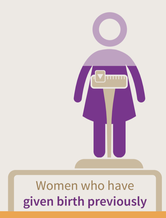
Women who have given birth previously

compared to 63% of women who have given birth previously.