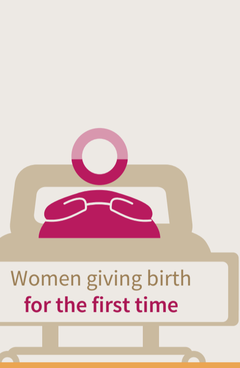
Women giving birth for the first time

72% of women giving birth for the first time felt they were always involved enough in decisions about their care during labour and birth,