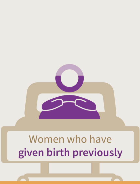
Women who have given birth previously

compared to 79% of women who have given birth previously.